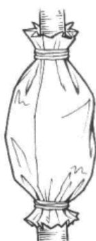
Aluminium foil or plastic sheeting is wrapped around the moss and tied at both ends. This cover is removed 2-3 months after tying or when the roots can be seen.