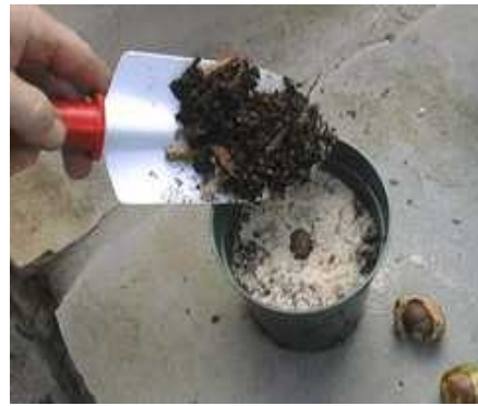
Potting up single seed