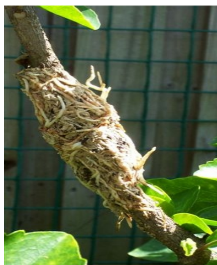
Sphagnum moss around girdling before covering