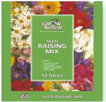
Commercial seed raising mix