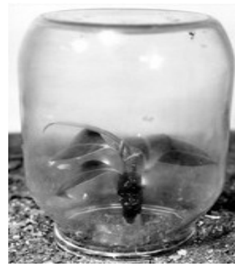
Scion housed under bell jar

The use of a plastic bag will mean that short stakes or wire frame will be required to support the bag to keep it from leaning on the scion. The bag will need to be securely tied around the container or the base of the understock if it is an inground plant. The completed graft must be shaded from direct sunlight—newspaper, opaque plastic bags, hessian or similar material will be satisfactory for this purpose.