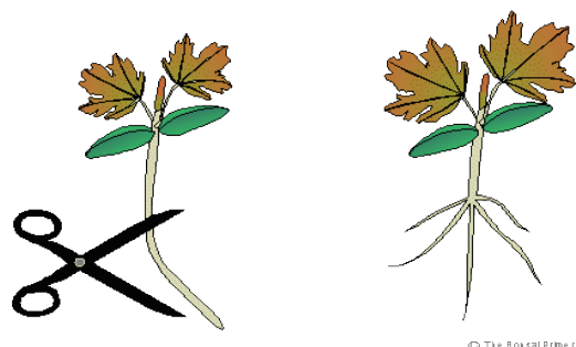
Cutting the Radicle

Plant in a small pot (7-10 cm) filled with 2 parts river sand and 1 part peat moss or an open seed raising mixture. Make a hole in the centre of the mixture, place the root in so that the seed kernel rests on the surface of the mix. Place in a well lit, protected area inside or outside. Keep the mixture moist but do not overwater. Only pot up when the roots comfortably fill the pot. Never overpot and use only a free draining, open mix.