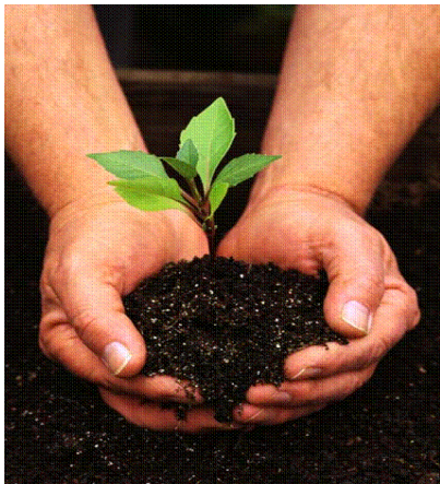
From little things

Do not disturb this moss and root mass but place in a pot slightly larger than the root ball and fill with a good quality potting mix, gently pressing some of the mixture into parts of the root ball making sure not to damage the roots. Place the plant in a shaded, wind protected area, and water as necessary. Water occasionally with weak liquid fertilizer or apply Osmocote Plus to the surface. If early flower buds develop these should be removed to help promote future growth.