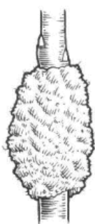
The girdled stem is covered with damp moss.