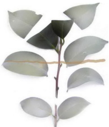
How to prepare a cutting

Using a razor sharp knife, cut the base of your cutting just below a growth bud on a slant using a soft wood cutting board to prevent squashing the cambium layer. Good results have been obtained by making a cut about 1cm long, exposing the cambium layer at the lower end of the cutting by removing the bark, which gives a much greater area to callus and produce roots. Cuttings may be dipped in hormone power if available, eg. "Rootex" or "Clonex".