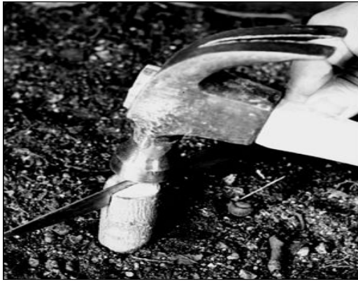
Splitting the rootstock