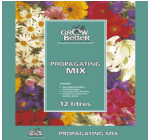
Specially formulated propagating mix