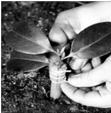
Tying off after scion insertion

Most grafts require to be secured with grafting or budding tape around the top of the understock to prevent the scion moving or even falling out of the cleft, however, a very large understock will provide enough pressure to make tying unnecessary. If you have any doubts at all tie the graft rather than take a chance. Label your graft, cover the soil with a layer of clean sand and enclose the graft with a large glass jar or plastic bag