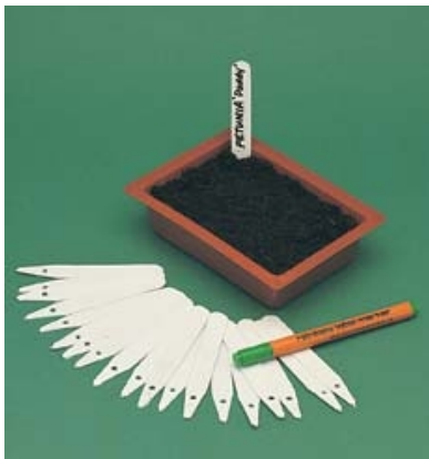
Don't forget to label seedlings