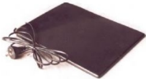
Small heat mat

Propagation whether from seed, cuttings or grafts is made much easier with the modern facilities of bottom heat, misting and extra lighting. However the old time growers had none of these and using simple methods the home gardener can achieve good results perhaps adding equipment later should this aspect of camellia growing prove attractive.