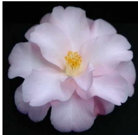
Great things grow