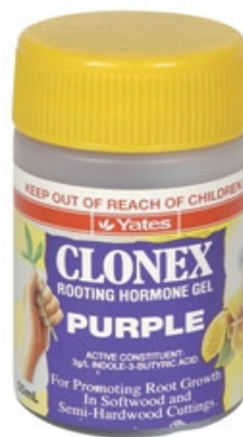
Rooting hormone to improve strike rate