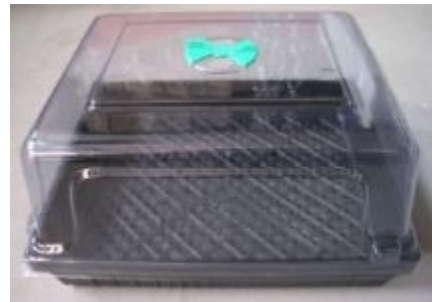
Covered & vented seedling tray